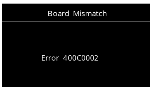
Figure 1: Error code indicating mismatched boards